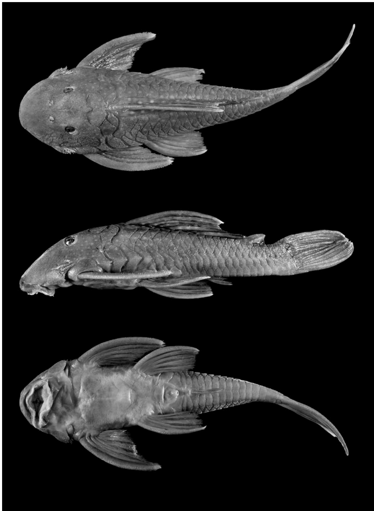
Fig. 2. Baryancistrus demantoides MCNG 54029, 150.5 mm SL; holotype, dorsal, lateral, and ventral views.